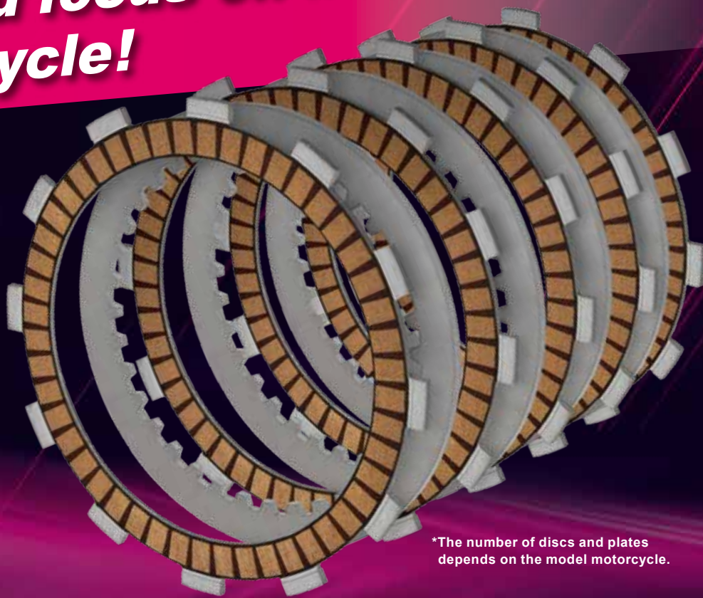
*The number of discs and plates depends on the model motorcycle.

* Since this product is used for racing, we cannot accept complaints or returns. In addition, specifications are subject to change without notice.